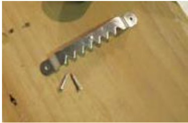
Bar Hook (Saw Tooth)