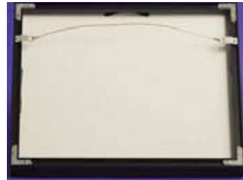
Wire Preferred Method